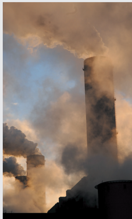
Gas drilling in Pennsylvania; solar-panel installation in Jiuquan, China; a coal plant in Grevenbroich, Germany's 'energy capital'.