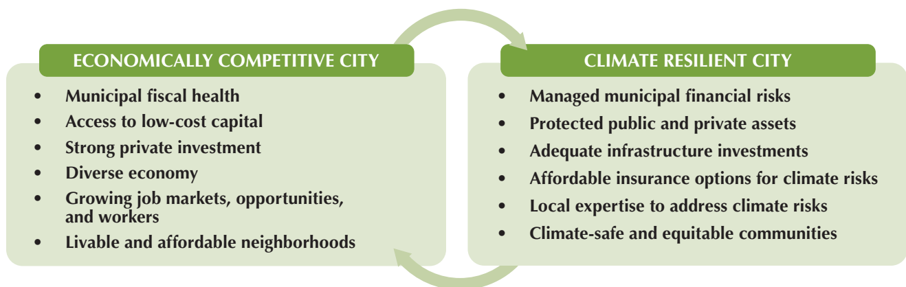
FIGURE 1: Reinforcing Components of Economic Competitiveness and Climate Resilience

The elements that make a city economically competitive and resilient to climate change reinforce each other.